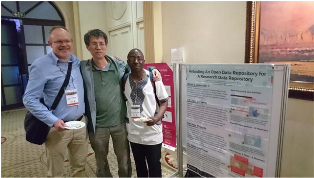
Presenting Our Poster – Retooling An Open Data Repository for A Research Data Repository – to Researchers from South Africa.