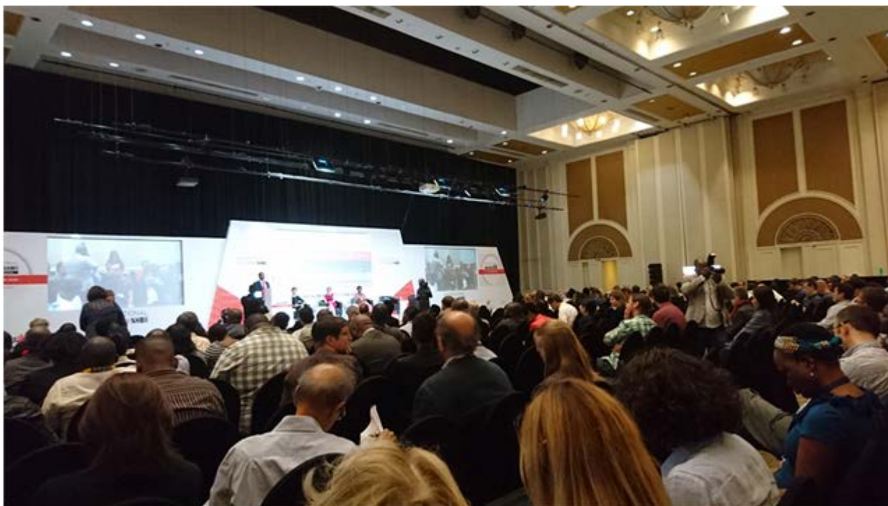
IDW 2018 Plenary Session and Panel Discussion: Data and Health.